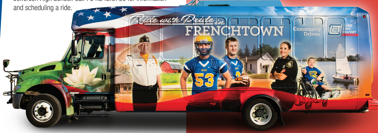
Lake Erie Transit is proof of the power of community. Because when everyone plays their part, the whole community wins.

Making life better for generations – that's the sign of a great community.